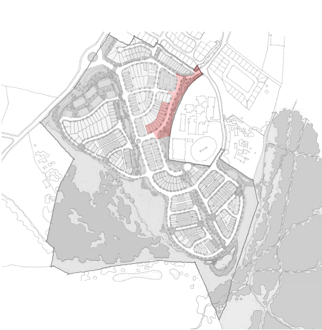
OVERALL KEY PLAN, 1:10,000 AT A1