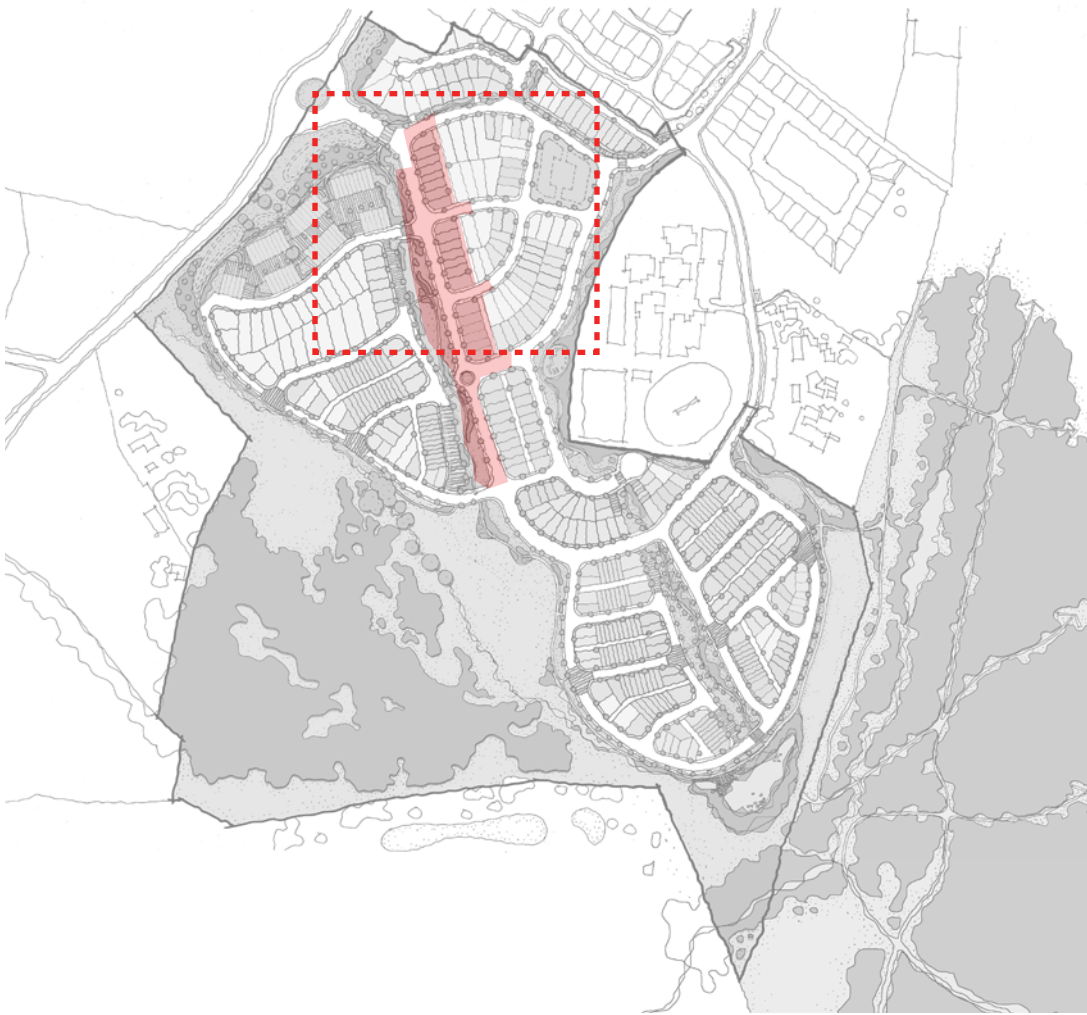
OVERALL KEY PLAN, 1:10,000 AT A1